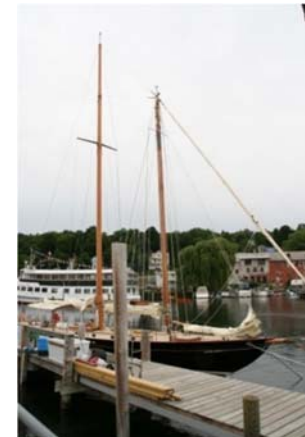
Sightseeing Boat Tours