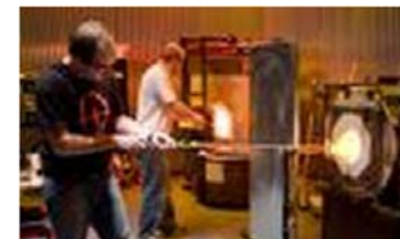
The Corning Museum of Glass