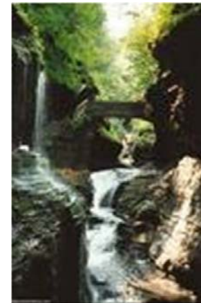
Watkins Glen State Park