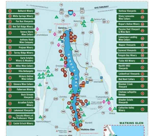
The Fingerlakes Wine Trail