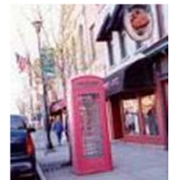
Antiquing and lots of shopping!